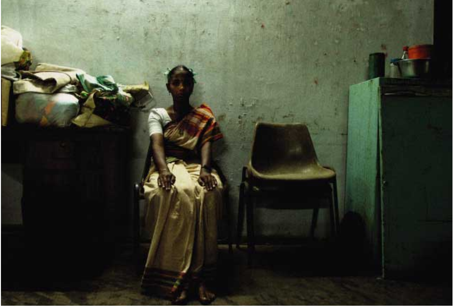
An infected sex worker from Mumbai seeks shelter at the Zonta Resource Centre in Pallavaram, founded to treat women who have nowhere else to go.